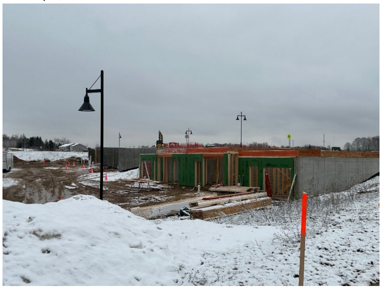
January 16, 2023