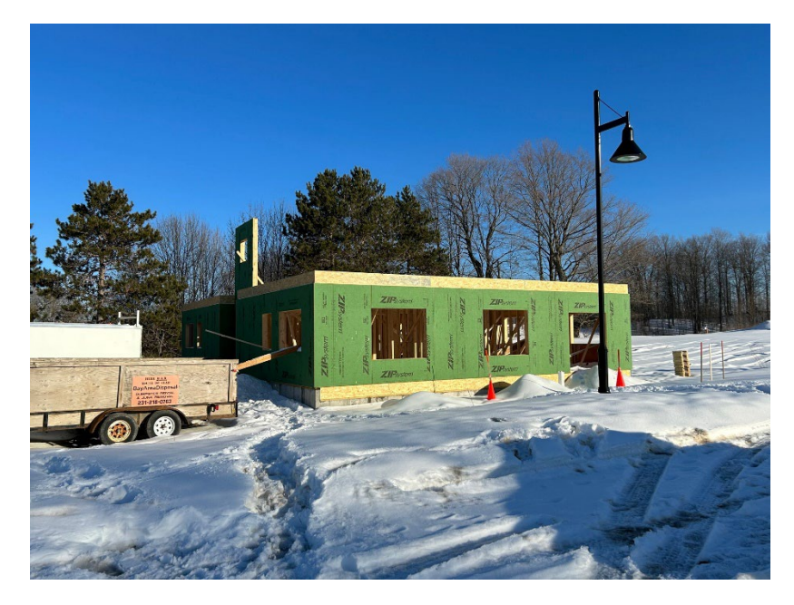
March 19, 2023