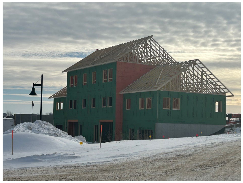
February 14, 2023