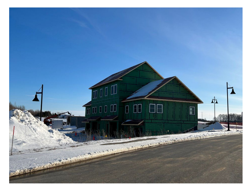
March 19, 2023