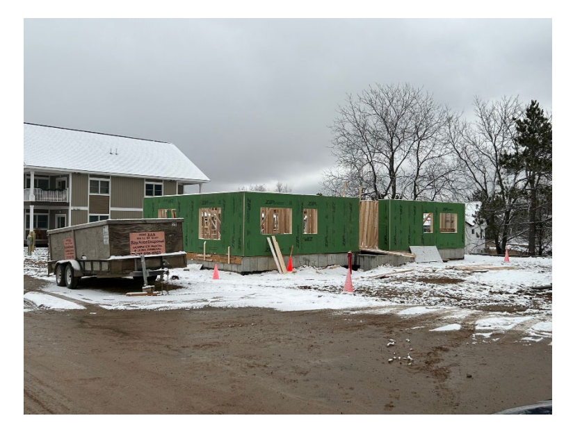
January 16, 2023