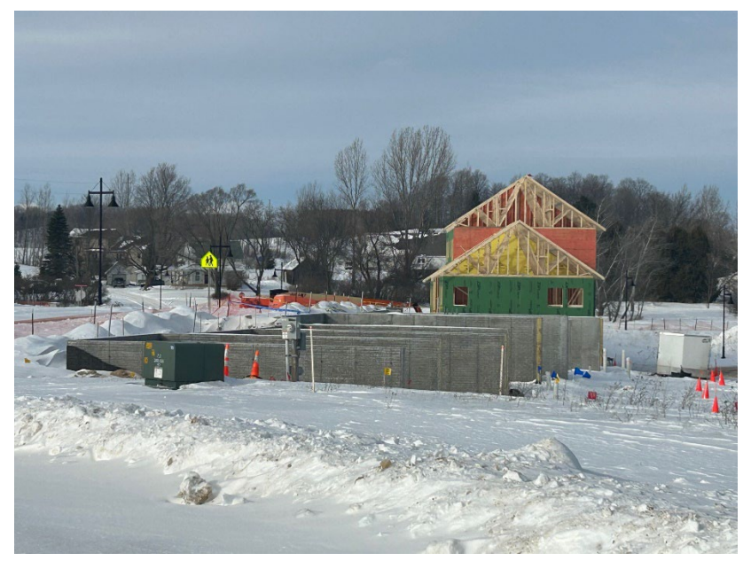
February 14, 2023