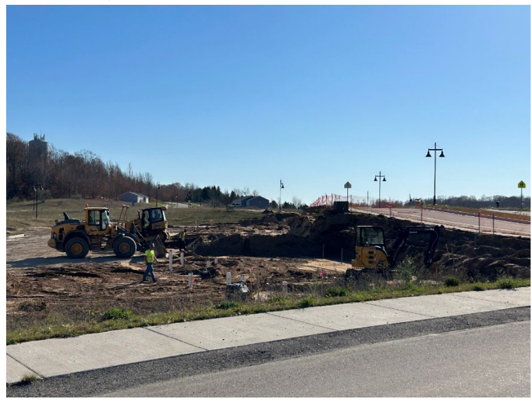
December 14, 2022