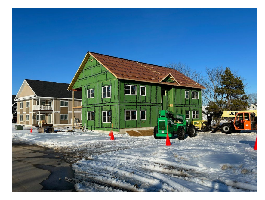
March 19, 2023