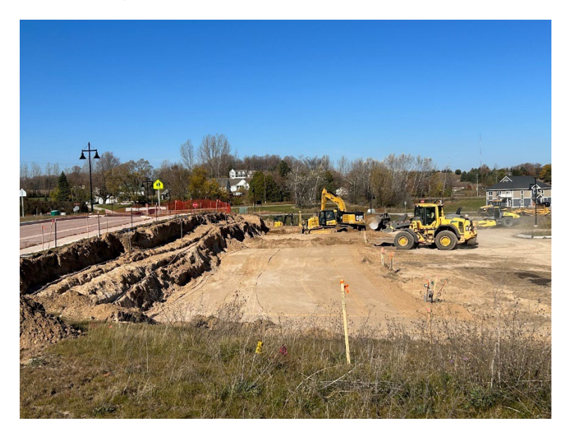
December 14, 2022