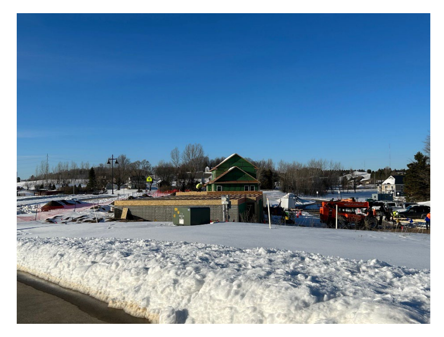
March 19, 2023