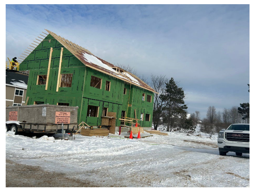
February 14, 2023