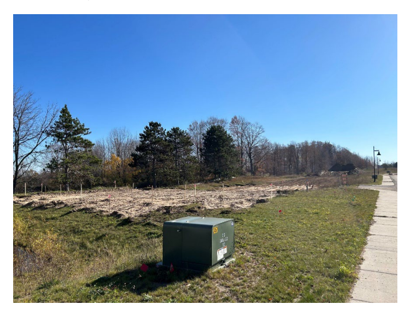
December 14, 2022