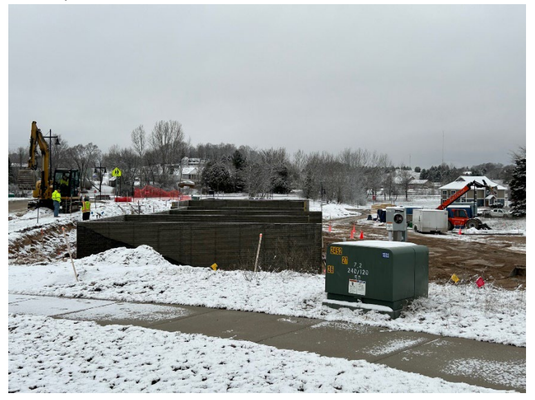
January 16, 2023